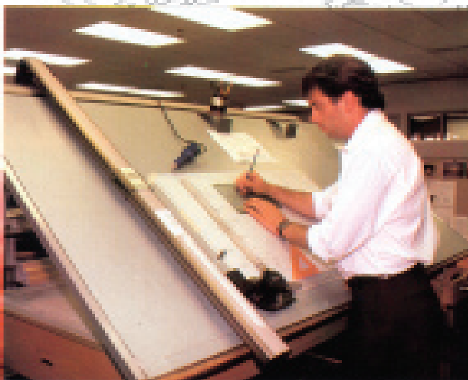
Shop detail drawings are prepared for nearly all fabrications.