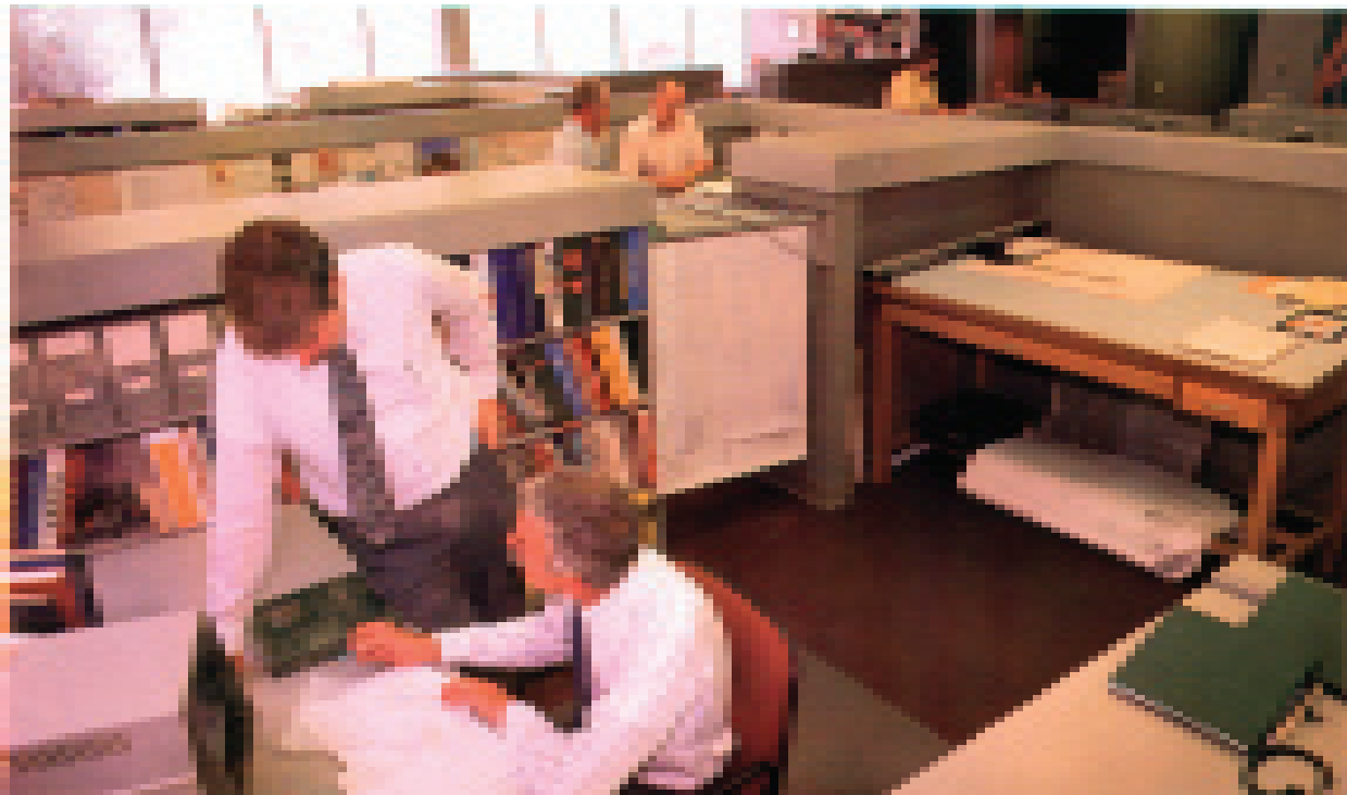
An experienced engineering staff is available to control design details of alloy fabrications made to demanding specifications.