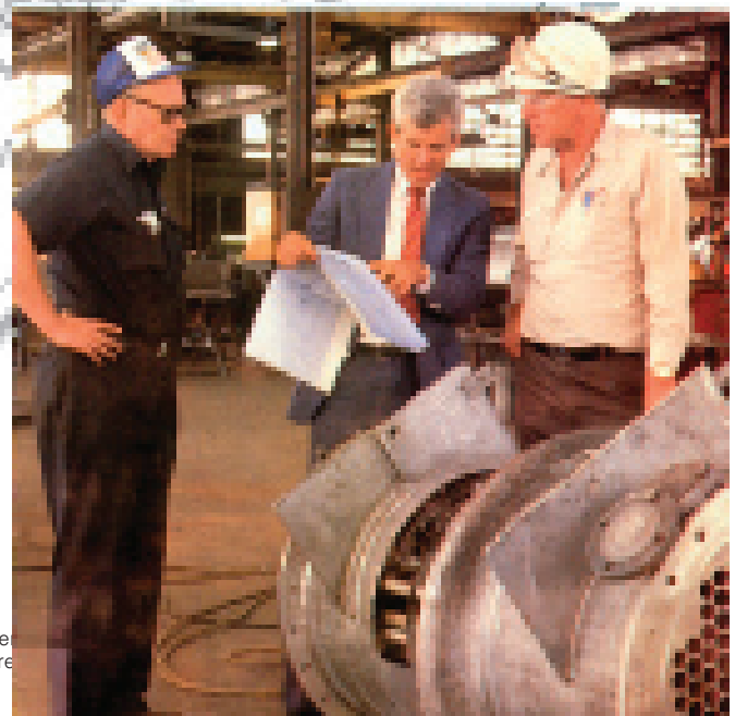
Close coordination between engineering and production ensure quality finished product.